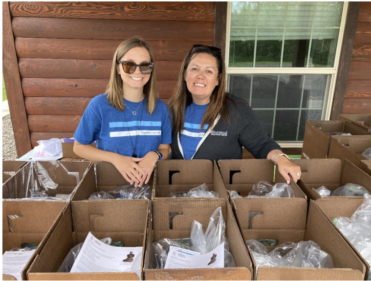
Population Health Program Manager at Riverwood Healthcare Center